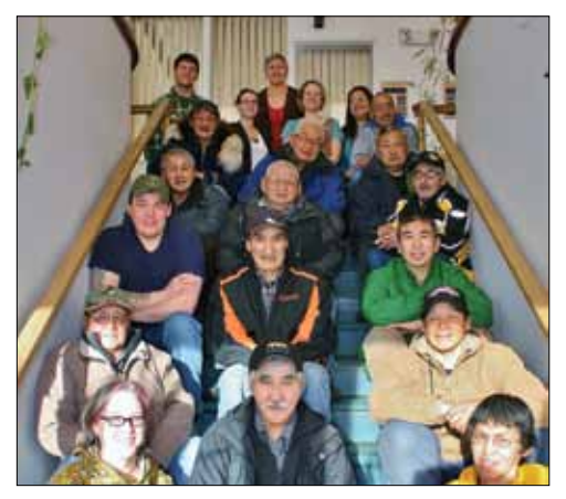
Kawerak Seal and Walrus Hunter Workshop.

If someone from the village dies, the hunters do not go out until the deceased has been buried. No birding, no picking, no egging,