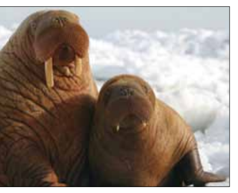
Fermented female or baby walrus is a delicacy in some Bering Strait communities.