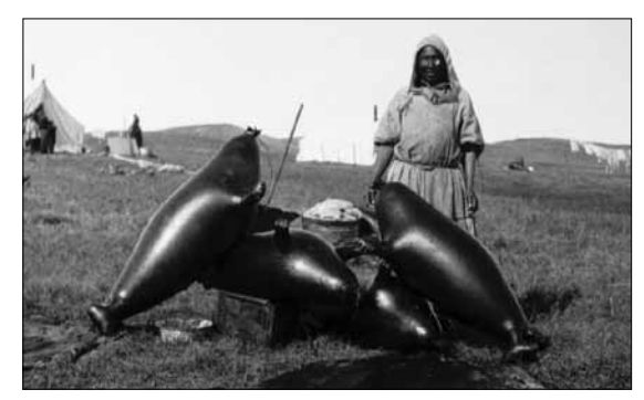
Seal pokes.

they put meat and food in there; they lasted a long time with the seal oil. Today they don't do that. There are too many freezers. Every time they go out hunting, they come back