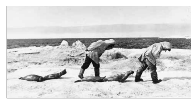
Bringing home their catch of seals.

When boating, hunters choose their prey carefully. They recognize the dark facial markings of rutting "gassy" seals, know when it will be impossible to reach