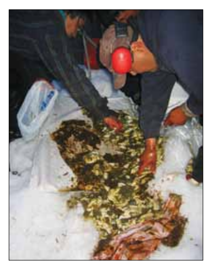
Clams from a walrus stomach.

The main thing I look for is a female with calves, that's a delicacy on the Island [Saint Lawrence Island]. Fermented female or baby walrus, we use that for special occasions such as birthdays. The mother of the