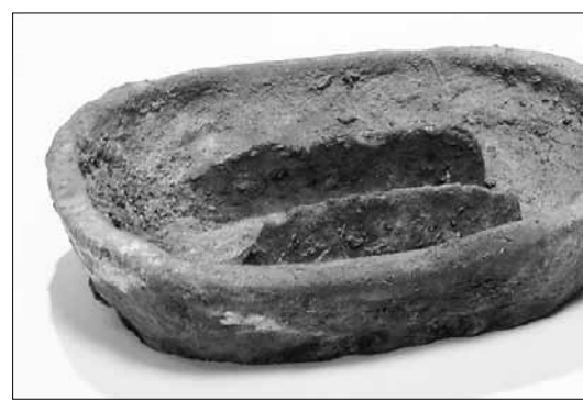
Seal oil lamp from Gambell.

Every home we went in had a seal oil lamp. It was kind of stink but we had no choice. When the oil was a little brown, it would be stink;