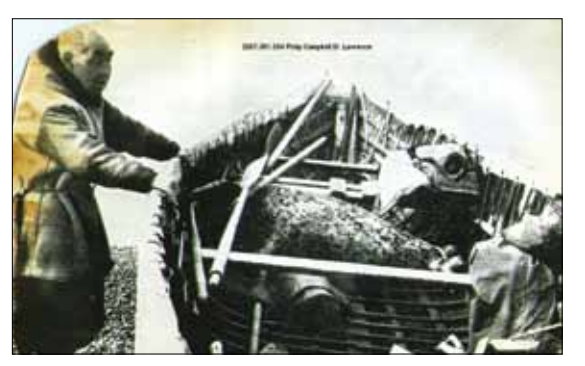
Philip Campbell of Gambell with a walrus hide boat and a seal float.

season, and they needed to be put away correctly. The women in the family developed many tasty methods to do so. Many of these delicacies are still popular today, and people learn traditional