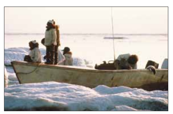
A marine mammal hunting crew from Shishmaref.

strong in our region and have adapted as needed. For example, many hunters use modern gear to reduce the odds of losing a harvested animal, and others articulate how