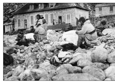
Diomede women splitting walrus hides.

Animals are not here to be slaughtered for the heck of it. If you don't need them, let them