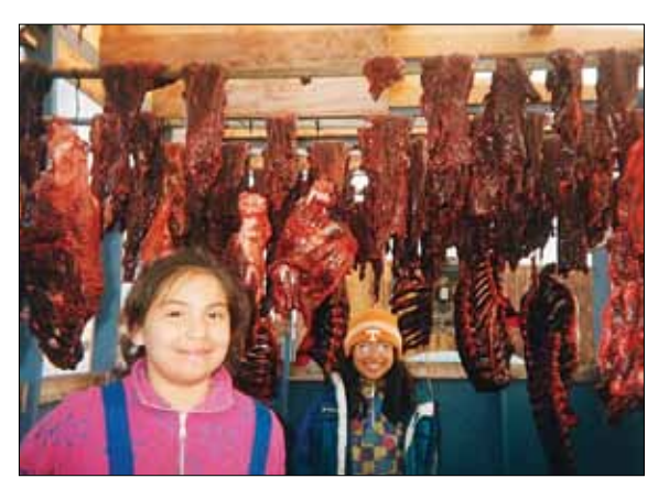
Bearded seal meat hanging.

they may think me to be boring, and they may hear what I say, but it won't stick. You can put it on paper; it's the same knowledge, I'm glad you're doing this. Preserve what we are