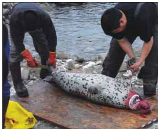
Respectful hunting means caring properly for a harvested seal.

Traditionally, bearded seals were thought to give themselves to hunters because they were thirsty and hunters would give the bearded seals a last drink of water after they were killed. The eyes were cut so the bearded seal couldn't see the hunters. Hunters were taught