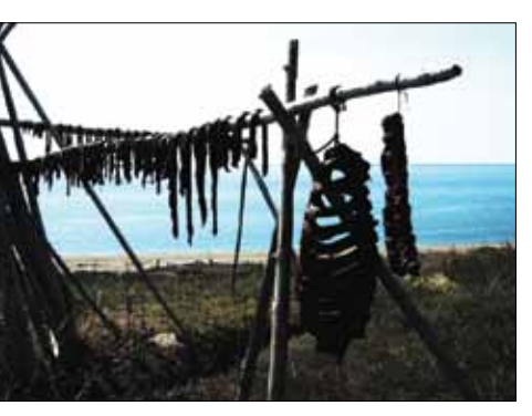
Bearded seal drying.

[We used to use] seal skin pants, mukluks, reindeer parka, Eskimo