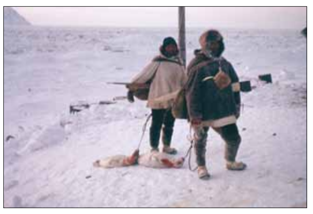
Bringing home seals to Diomede.