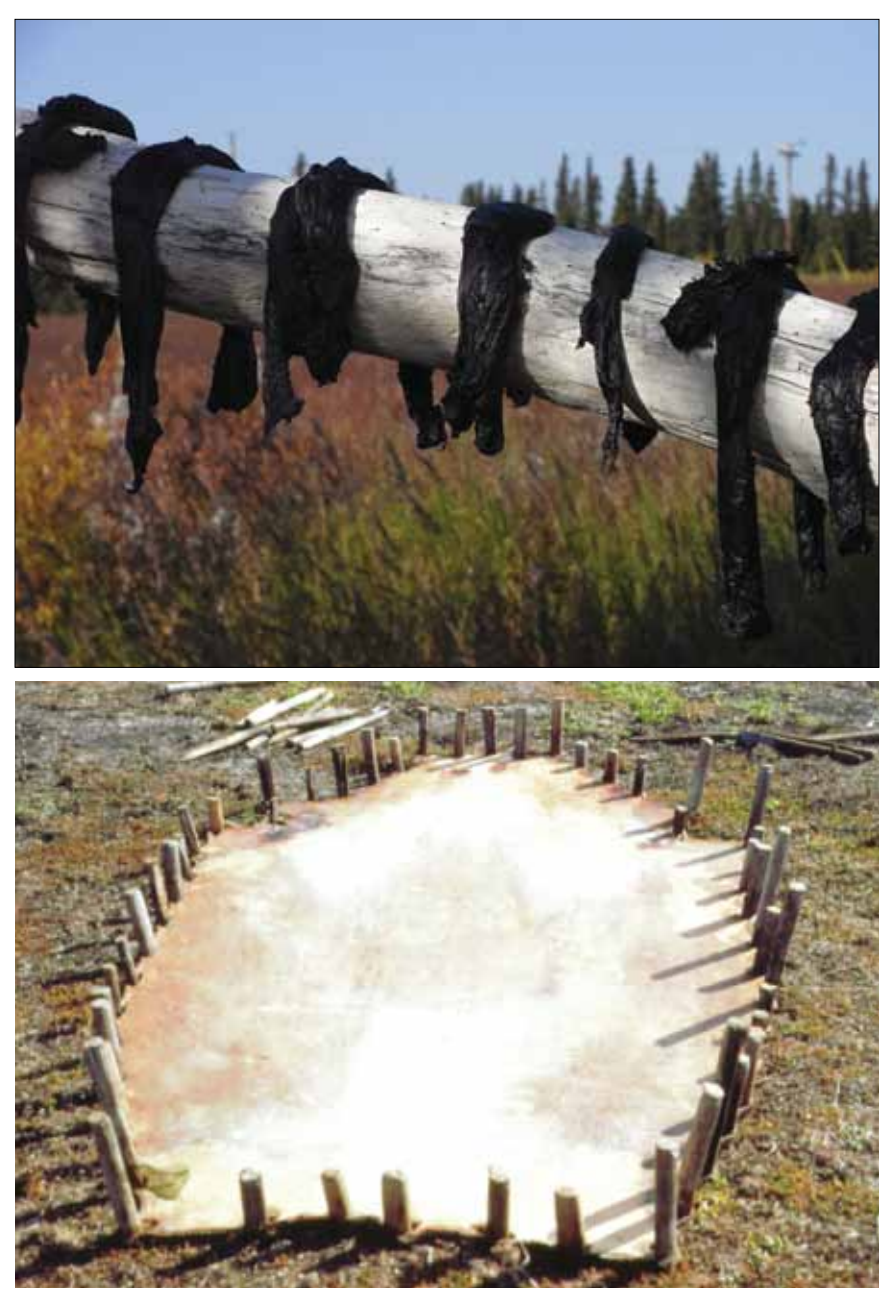
Respectful hunters harvest only what they can put away and use. Top: Seal meat drying. (Photo: Julie Raymond-Yakoubian). Bottom: Stretching a bearded seal hide, Shishmaref. (Photo: Kawerak Eskimo Heritage Program).