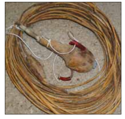
Seal hook. Having the right gear is important when retrieving a seal.

I have a lot of feeling for these animals. It hurts when I see young people shoot a seal and they can't get it. What a waste. It's better for them to be