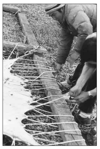
Stretching a hide in Gambell.

Food preparation for storage was traditionally a lengthy process. The foods needed to be put away to sustain the family until the next