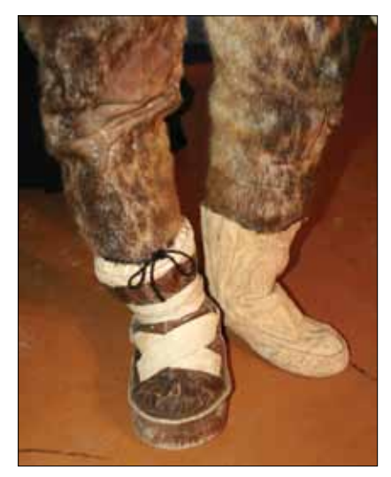
Sealskin pants and mukluks.

My grandfather never wasted, never take more than you can. Most of the time we did not have ammunition. We mended things with sinew. We netted birds from the tundra with fish nets and rabbit snares. Later there came metal traps and snare, that made life a lot easier. The women braided