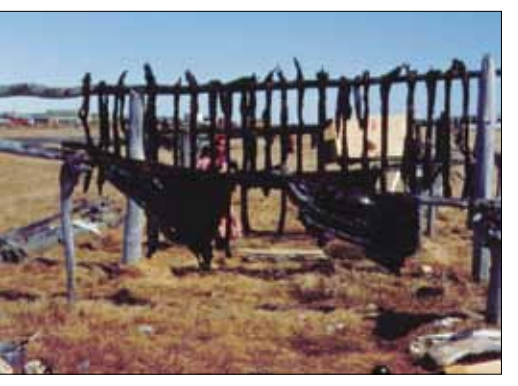
Bearded seal meat drying in Shishmaref.

A hunter is accustomed to his own schedule. As the seasons change, he knows when and where to carry out his subsistence