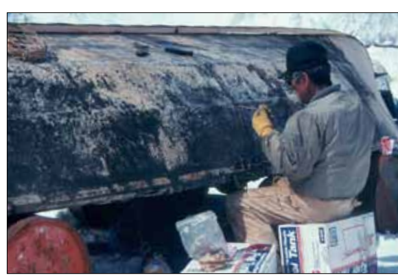
Repairing a skin boat.

Hunters also noted that it is important to respect other hunters and not to interfere with someone who has gotten a seal. Many hunters stay away from other communities.