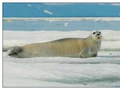
Bearded seal on ice. Before shooting a bearded seal, seal, or walrus, make sure that the ice conditions will not prevent you from retrieving it. This ice is solid and it would be easy to retrieve the bearded seal.

ugruk anywhere but on the base of the neck. It paralyzes it. They're strong animals, you watch what