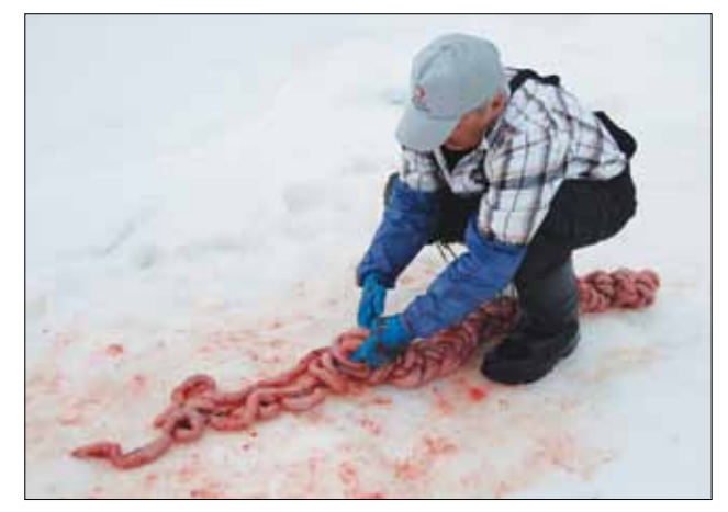
Bearded seal intestine being prepared for transport.

shot and knives are not used on them. The meat of the seal caught in a seal net is real rich. The tradition is that whoever sets the