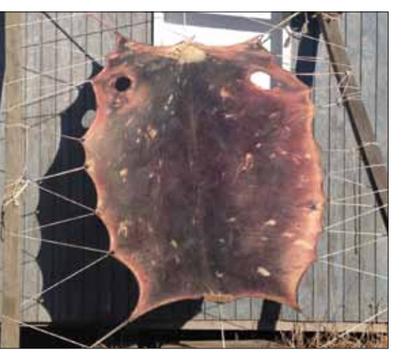
Bearded seal hide stretched and drying.