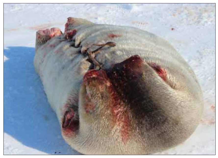
Sewn bearded seal ready for transport.

When I was growing up we had hard times. People shared what they got. My two grandpas had qayaqs and they would go seal hunt when there was no wind. They go with dog team and caught ugruk. When someone caught ugruk all the women went to that person and got a share....–Kenneth Dewey, Koyuk