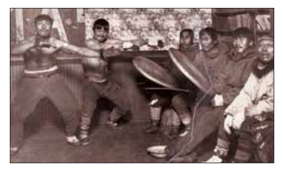
Diomede men drumming and dancing with walrus stomach drums.

until the game was gone. They would catch as much as they could and store it; they learned and knew how to put away food. Like drying them and putting them in storage.