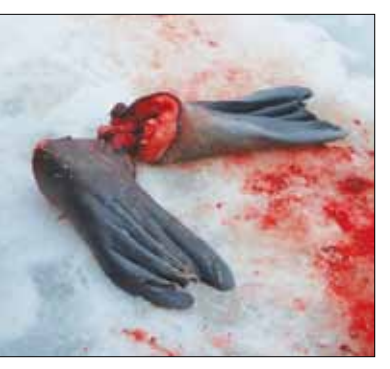
Bearded seal flippers.

It's a lot of fun hunting when you're young and strong. The coffee tastes different out there. The air tastes different. You're just in a good mood all the time because you're hunting with your fellow hunters, people you grew up with. You're doing something positive, you're trying to catch a meal to bring home for your mom and dad or wife, whomever. So they can cut it up and give it away, cook it the next day. They don't cook it right away, they say to let the meat relax for a few days at most if it's a walrus or ugruk.... It takes a while for the meat to relax so it won't be so hard.— Vincent Pikonganna, King Island