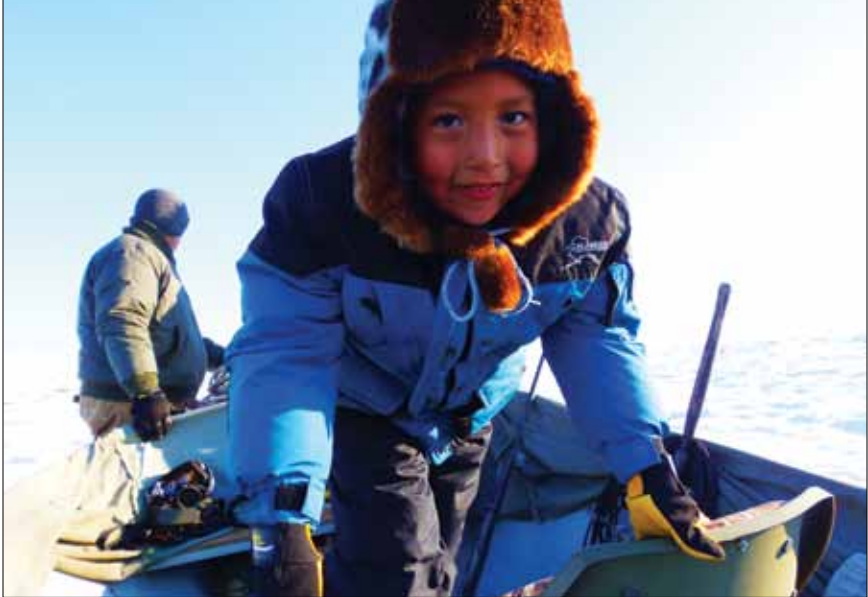
Kids learn by doing. Top: Learning to cut a seal in Gambell. (Photo: Kawerak Eskimo Heritage Program). Bottom: Hunting with the adults. (Photo: Brandon Ahmasuk).