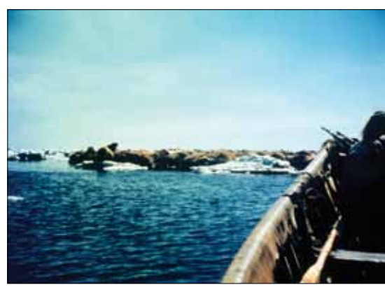
Approaching walruses on ice.

Sight in your guns and practice. On the surface of the water your target will be about the size of a football.