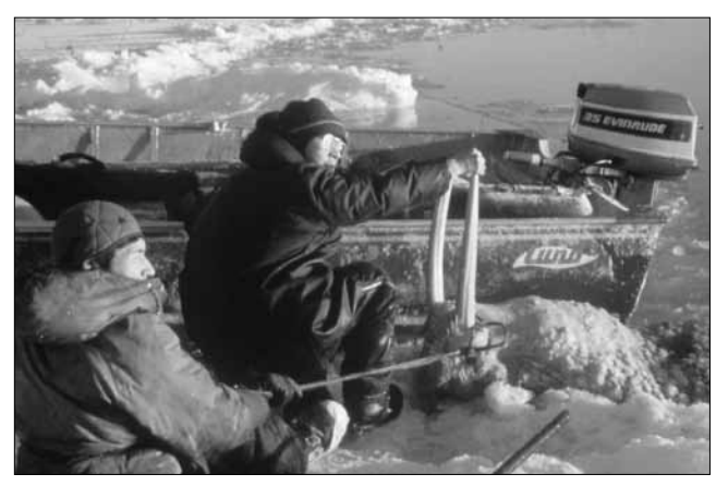
hunter and to those who helped him. Today, division of catch varies and depends on the boat captain. He may still practice the traditional methods of measurement, he may split

Traditionally, different communities had rules about how catch should be shared. There were specific ways, for example, of dividing a bearded seal into shares, with rules about which shares go to the