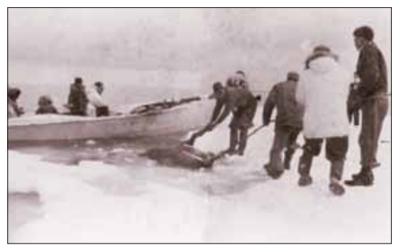
Working together helps prevent loss of catch.

Traditions of respect have been passed down family trees for hundreds of years. These traditions have been abided by and are beliefs