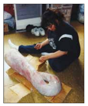
Processing a walrus stomach to be used to cover traditional drums.

You have to try not to make a cut in the skin of the poke while preparing it. If there were a gunshot hole in the skin it was sewn with leak-proof stitches. All the blubber was taken off the skin including the feet and arms, then washed, hung to dry a bit and then inflated