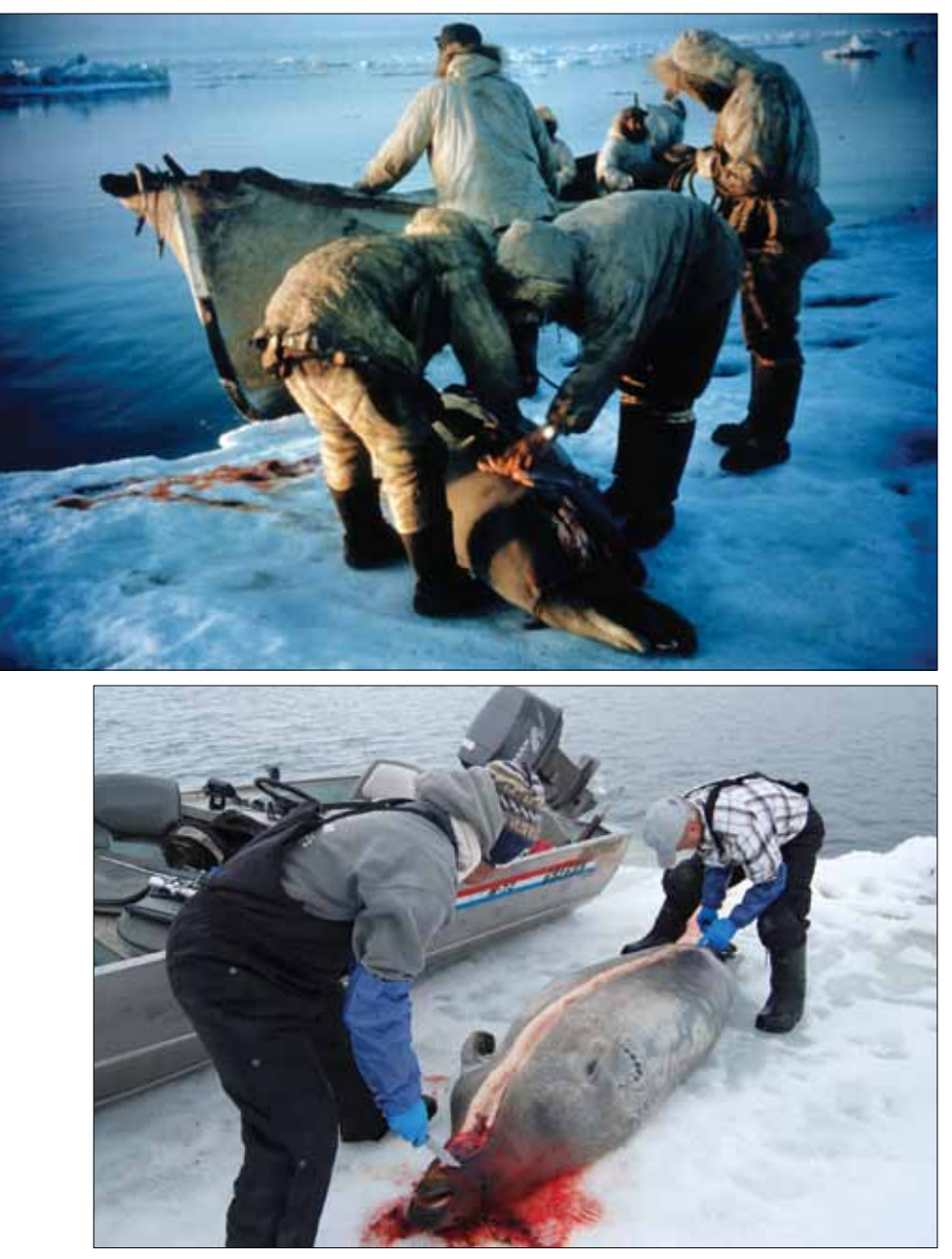
Equipment, tools and clothing change. Traditions of respect endure. Top: Butchering a bearded seal using traditional equipment and outerwear. (Photo: Kawerak Eskimo Heritage Program). Bottom: Butchering a bearded seal today. (Photo: Lily Gadamus).