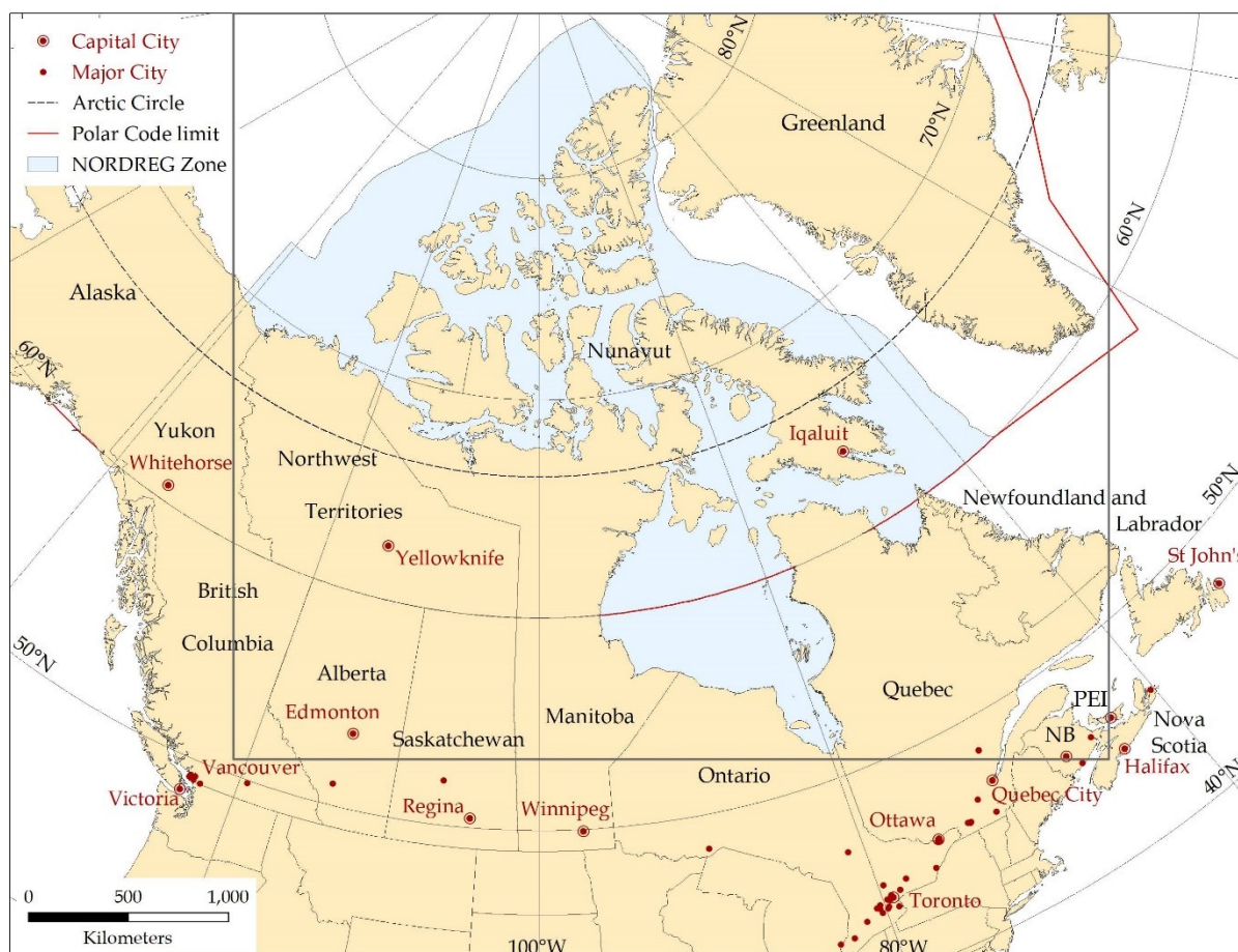
Figure 1: Map of Canada situating the Polar Code Limit

8 As shown in Figure 1, the Polar Code applies to Canadian waters located above the 60th parallel north. 1 Three territories – Yukon, the Northwest Territories and Nunavut – lie above 60° N and make up the vast majority of Canada's Arctic land. For a detailed analysis and overview of Canada's Arctic, see PPR 6/INF.24, An overview of Canada's Arctic and role of maritime shipping .