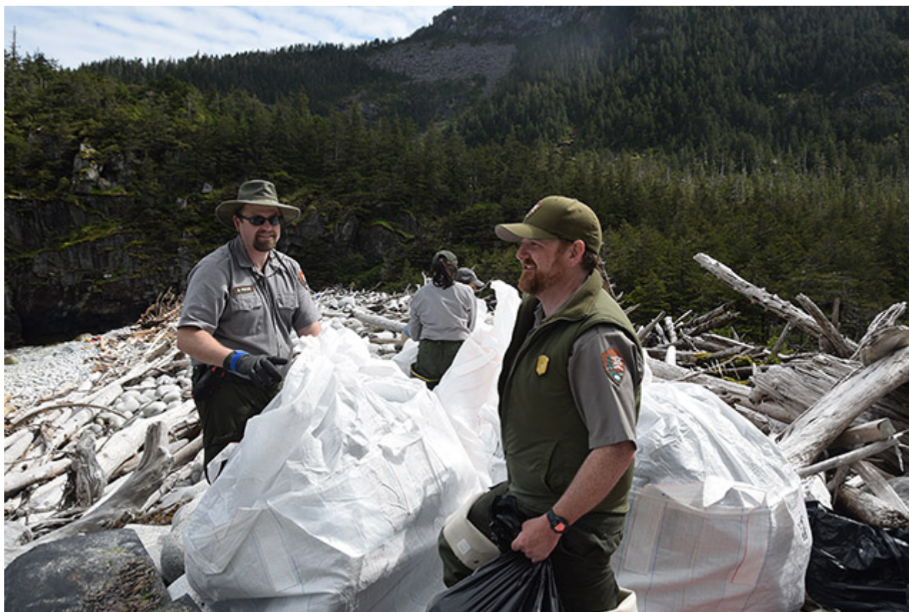
Figure 1. Kenai Fjords National Park staff bag marine debris at Black Bay, a "collector beach" in the park. The trash is loaded into large white super sacks to be lifted off the beach by helicopter later.