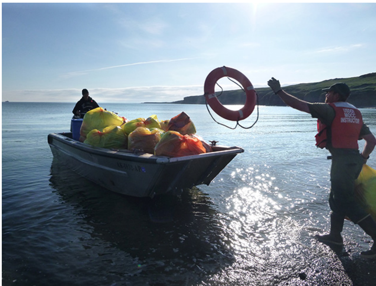
Figure 5. Researchers collect marine debris in Katmai National Park and Preserve.

of debris overall: the Gulf of Alaska (Katmai, Kenai Fjords, and Wrangell-St. Elias) and the western Arctic (Bering Land Bridge and Cape Krusenstern). The Gulf of Alaska beaches had significantly more debris than the western Arctic beaches and the difference was likely driven by the much higher levels of plastic and foam in Gulf of Alaska parks ( Figure 8 ). This difference may result from the physiographic constriction caused by the Bering Strait, the only connection of the Pacific to the Arctic Ocean, with oceanographic currents moving generally northward into the Arctic Ocean. The Bering Strait limits potential debris moving north from the Pacific Ocean to a 53-mile-wide gap, which affects how much debris reaches the western Arctic parks. Marine debris in the western Arctic parks seemed to be derived more from local terrestrial sources, such as coastal villages and numerous fishing camps, with light input from pan-Asian sources; previous surveys appeared to show that Cape Krusenstern debris sources derived more from local inputs while Bering Land Bridge's debris sources were more regional. In contrast, the Gulf of Alaska parks are closer in proximity to the north Pacific Gyre, which harbors significant amounts of marine debris from many sources. Accumulation on Gulf of Alaska beaches occurs primarily during winter storms with strong onshore winds ( Pallister and Gaudet 2011 ).