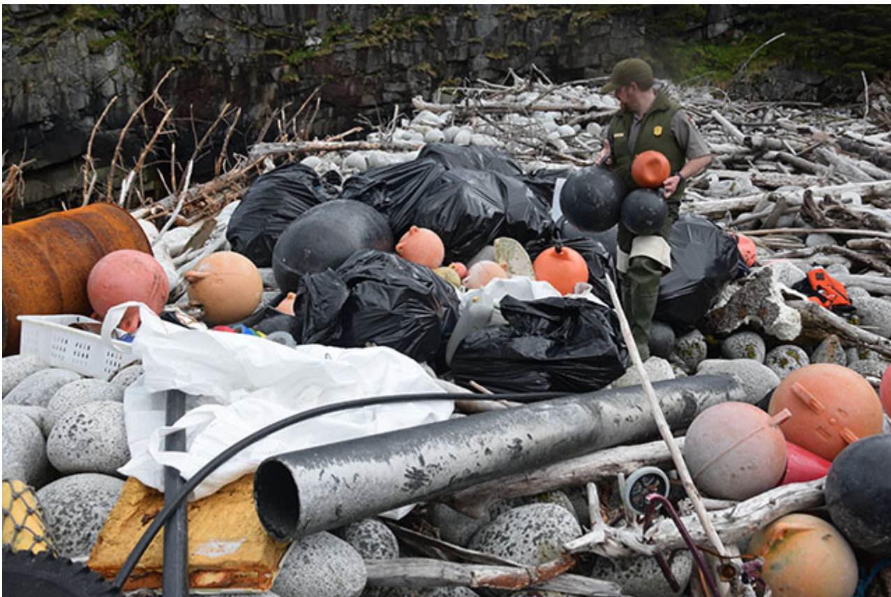
Figure 8. Marine debris collected at Black Bay in Kenai Fjords National Park.

Prior to 2015, four of the five parks (Kenai Fjords, Katmai, Bering Land Bridge, and Cape Krusenstern) had initiated NOAA marine debris monitoring protocols ( Opfer et al. 2012; Lippiatt et al. 2013 ) to assess marine debris stocks and refreshment rates. In Alaska, the NOAA protocols were modified to document the large amount of marine debris that gets pushed inshore beyond the initial beach berm to a second barrier (such as a lagoon) by highly dynamic winter storms ( P. Murphy and S. Lippiatt, pers. comm., February 2013 ).