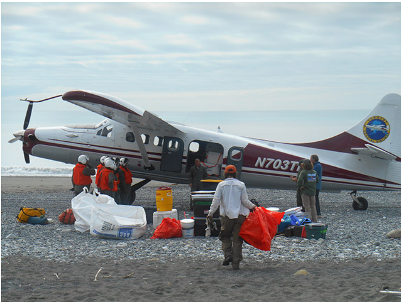
Figure 9. Marine debris is loaded into a plane in Wrangell-St. Elias National Park and Preserve.