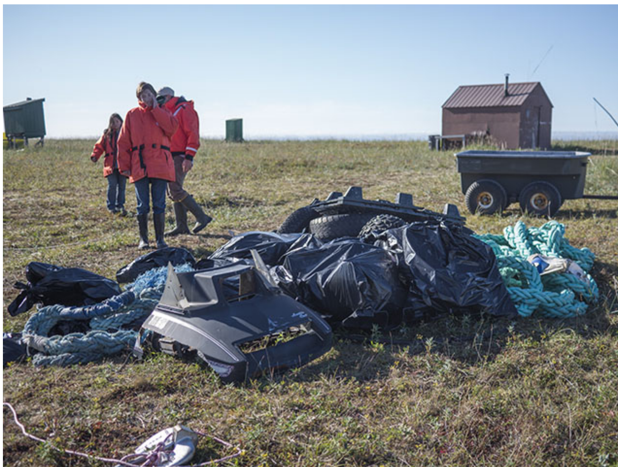
Figure 7. Of the beaches cleaned, Cape Krusenstern National Monument had the highest percentage of rubber.

Along with the NPS debris removal operations, another large marine debris project coordinated by the Gulf of Alaska Keepers occurred simultaneously. The Gulf of Alaska Keepers conducted large-scale removal of marine debris across the Gulf of Alaska extending from Kodiak Island to British Columbia; it was originally funded by the Government of Japan through the State of Alaska Department of Environmental Conservation and the National Oceanic and Atmospheric Administration (NOAA). This project included transferring existing marine debris “super sack” caches onto a Waste Management, Inc. barge that moved across the Gulf of Alaska, starting from Kodiak Island and ending in Washington State. Super sacks are large mesh containers that hold approximately nine 55-gallon garbage bags full of debris to facilitate storage and transport using heavy equipment. Existing super sacks and had been amassed by Gulf of Alaska Keepers during previous years of marine debris clean-ups.