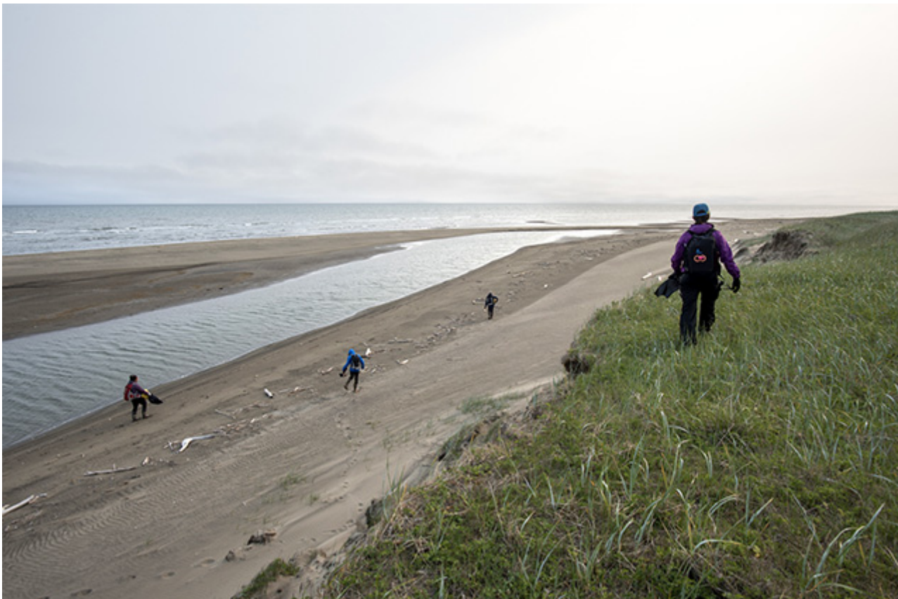
Figure 6. Researchers search for debris on a beach in Bering Land Bridge National Preserve.

This marine debris removal project involved an extensive number of partners, with National Park Foundation and National Park Service (NPS) Water Resources Division providing significant amounts of funding. The NPS provided personnel in all parks for the clean-up and logistics operations and the Alaska SeaLife Center managed data collection across the parks. Alaska Airlines donated 10 round-trip tickets for fieldwork across the five parks, and consolidated debris removal was coordinated with a Gulf of Alaska Keepers-State of Alaska marine debris removal project.