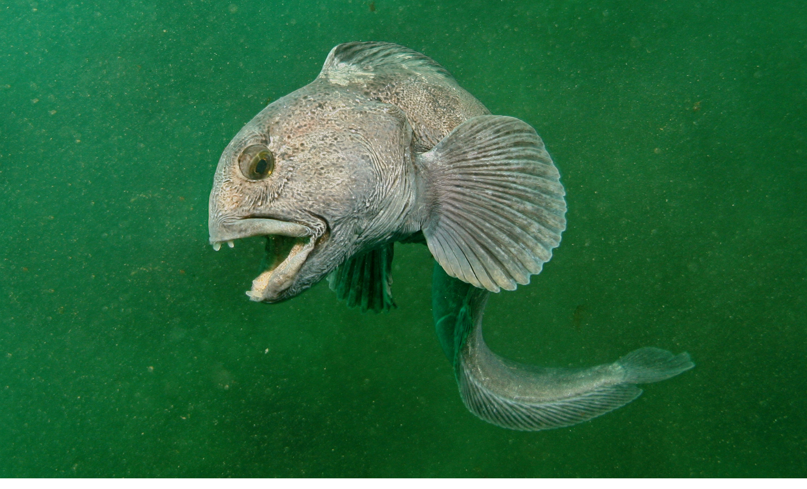
Atlantic wolffish (Anarhichas lupus).