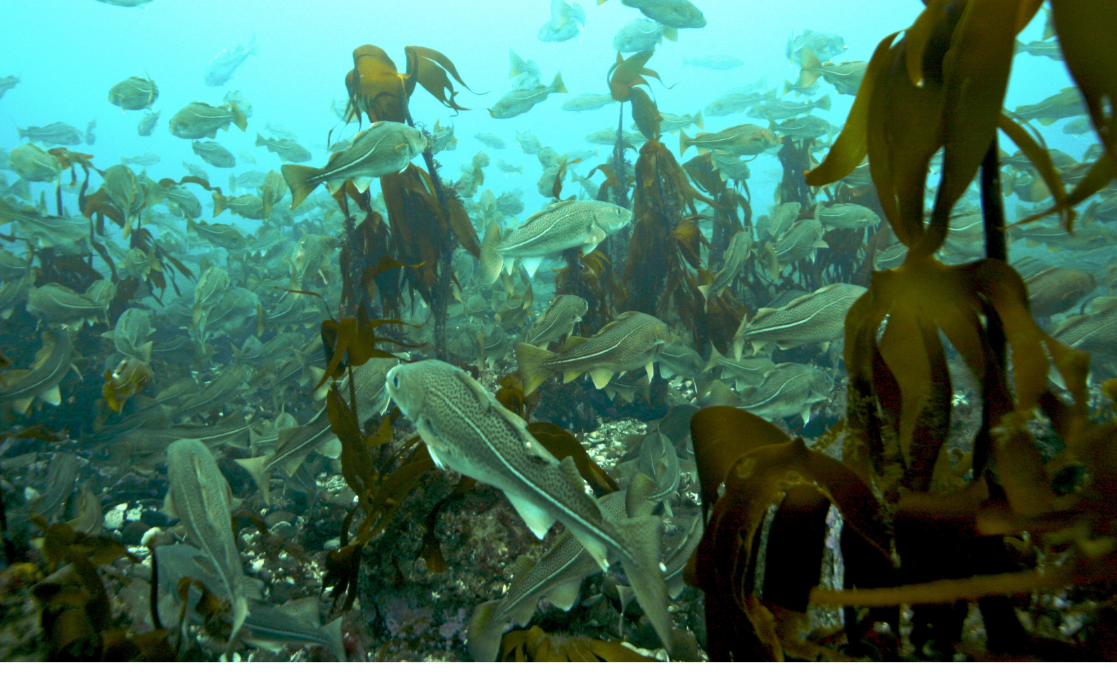
Atlantic cod (gadus morhua).

framework for doing this in a structured manner from both scientific and management perspectives. The scale of LMEs is appropriate for in-depth analysis of interactions between species in food webs and between species and their habitats within an LME. At smaller scales, an LME can be represented as a mosaic of habitats with different physical and biological attributes (rocky bottoms, muddy sediments, kelp forests, ocean fronts, etc). The overall state and integrity of the ecosystem is a reflection of the status of species and habitats and their interactions at all appropriate scales within the LME.